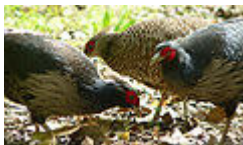
Provincial bird Of Sarhad