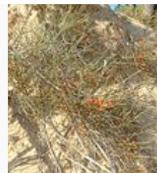
Provincial flower Of Balochistan (Pakistan)