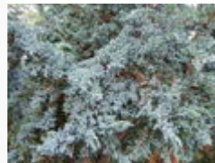
Provincial tree Of Sarhad