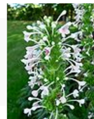
Provincial flower Of Sarhad