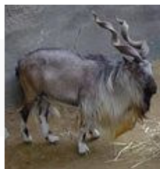
Provincial animal Of Sarhad