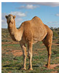
Provincial animal Of Balochistan (Pakistan)