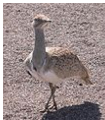
Provincial bird Of Balochistan (Pakistan)