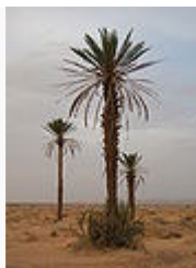
Provincial tree Of Balochistan (Pakistan)