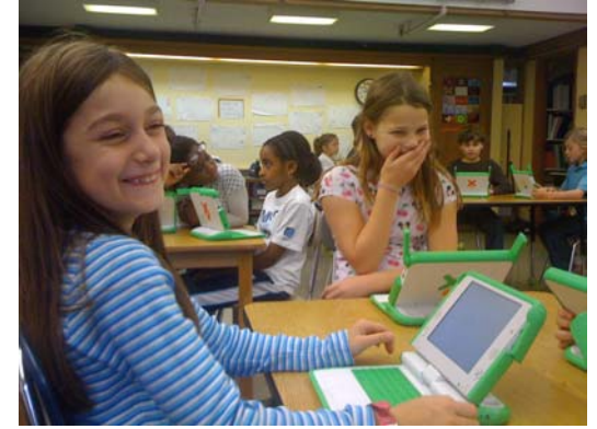
Fourth graders get to know the XO laptop.