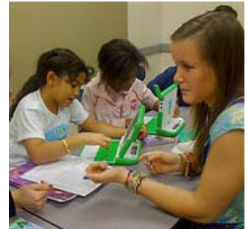
The Green Group (3 rd – 5 th grade) uses XO laptops for homework assignments.