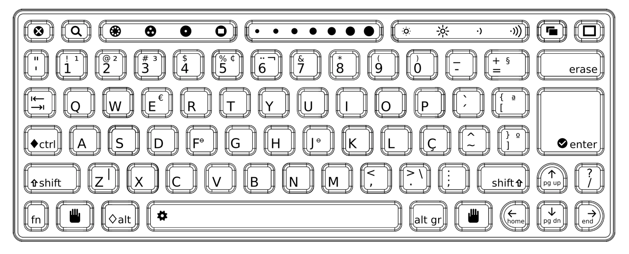
Figure 2.11: Keyboard Layout (Portuguese version shown)

a resolution of 1000dpi, and an active area of 6.0 cm by 4.4 cm. It is located underneath the plastic in front of the keyboard, maximizing the resistance to moisture, dirt, and electrostatic discharge.